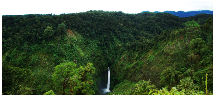
Sarapiquí