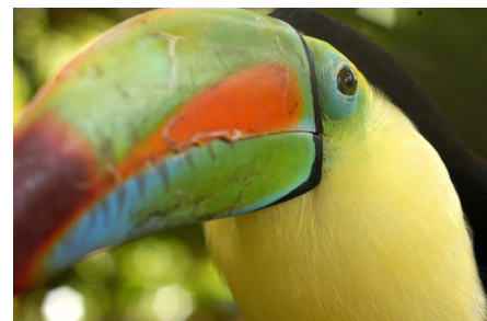
Keel-billed Toucan ( Ramphastos sulfuratus)