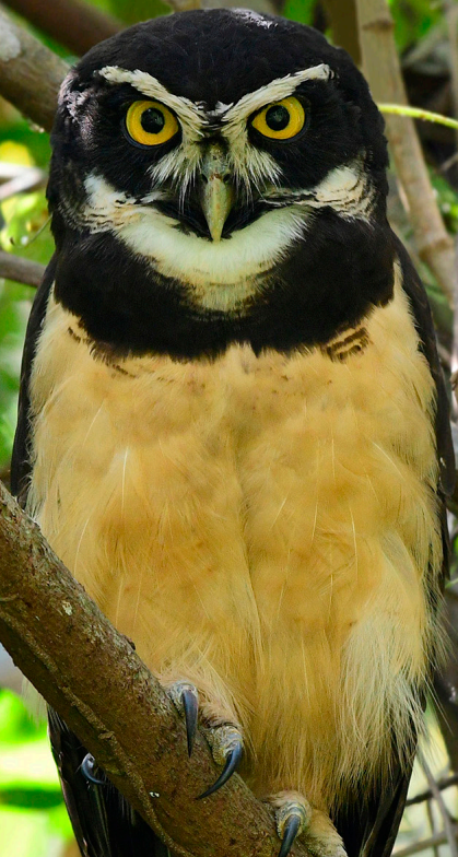
Spectacled Owl ( Pulsatrix persimillata )