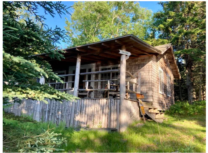
Main Lodge, exterior and interior

12) The facility is not wheelchair accessible.