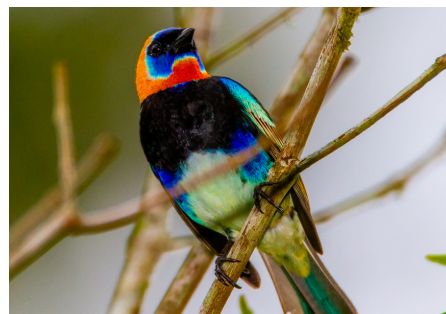
Golden-headed Tanager