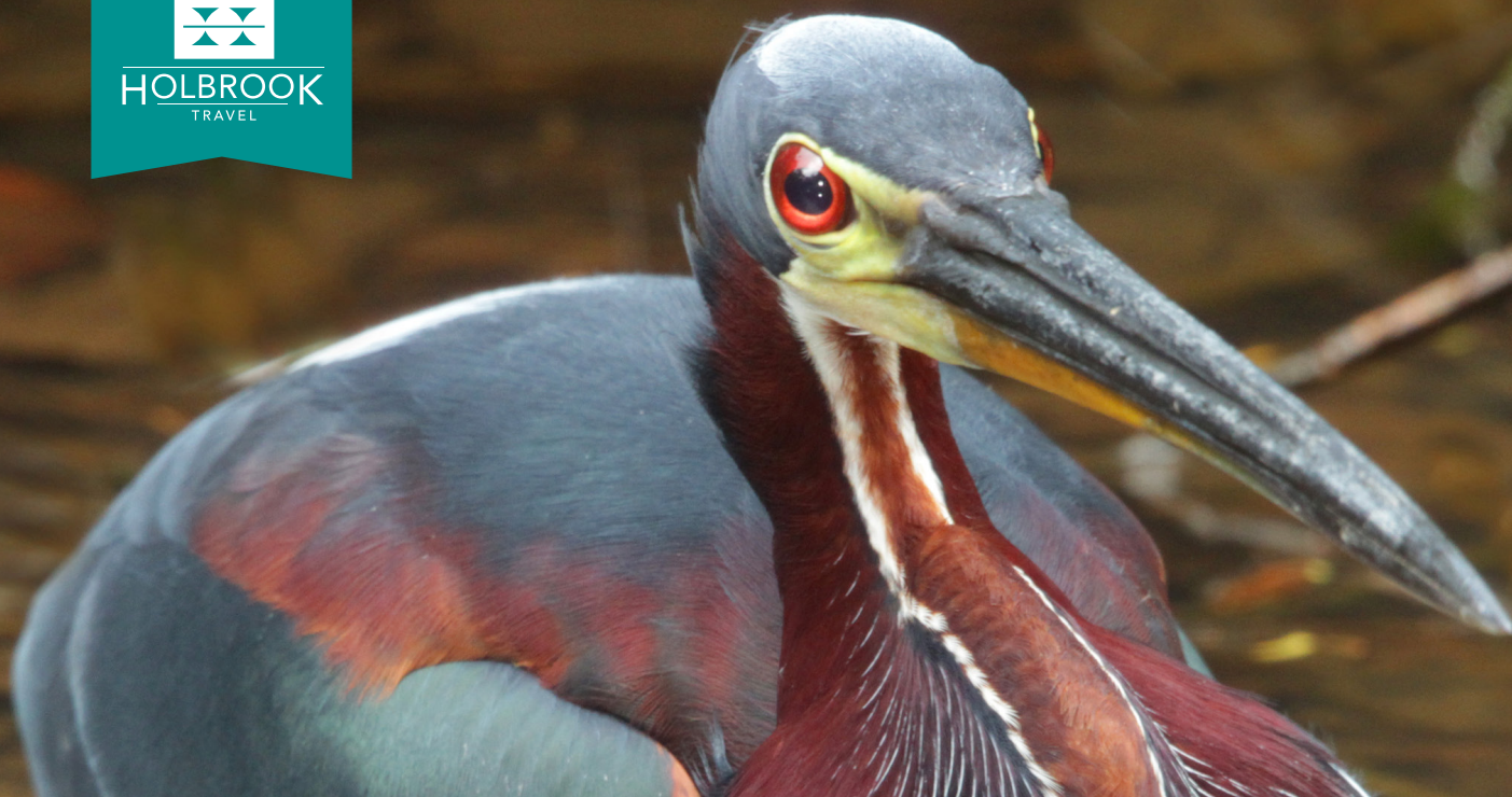
Agami Heron