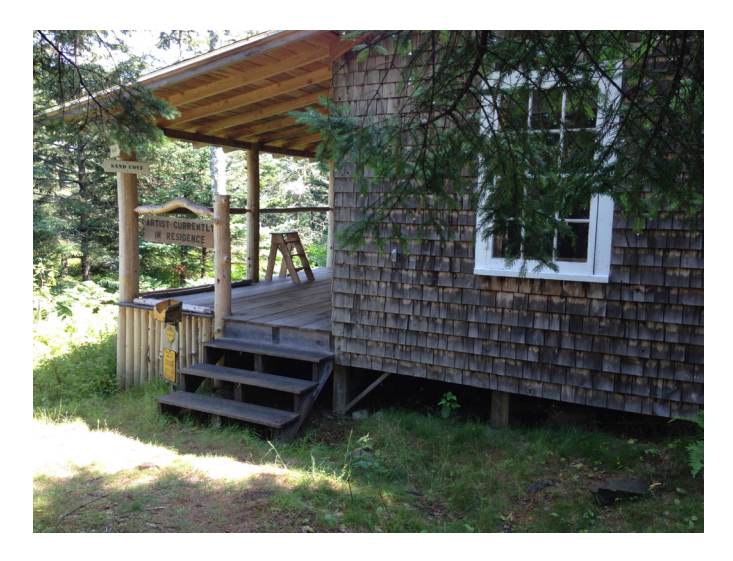
Main Lodge, exterior and interior