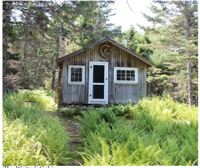
The Writer's Cabin

Applicants should be in good health and should be able to regularly walk the 6/10-mile uneven wooded path to the main campus for services. Expect solitude and immersion in nature, including varied weather and the possibility of ticks and mosquitoes.