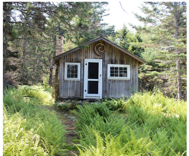
The Writer's Cabin

Applicants should be in good health and should be able to regularly walk the 6/10-mile uneven wooded path to the main campus for services. Expect solitude and immersion in nature, including varied weather and the possibility of ticks and mosquitoes.