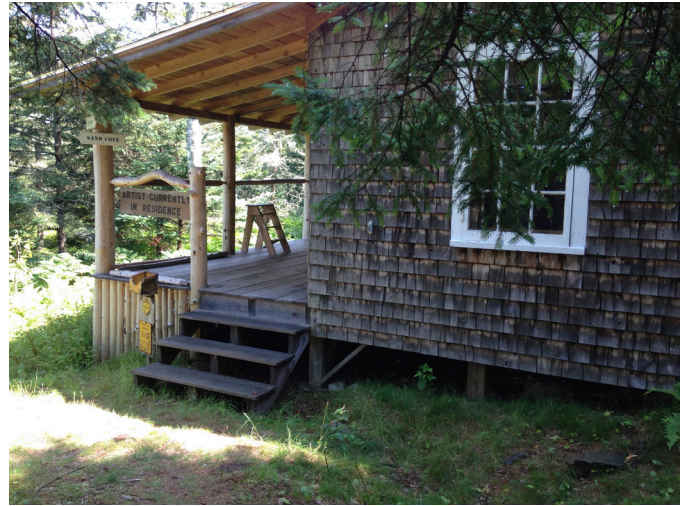
Main Lodge, exterior and interior

12) The facility is not wheelchair accessible.