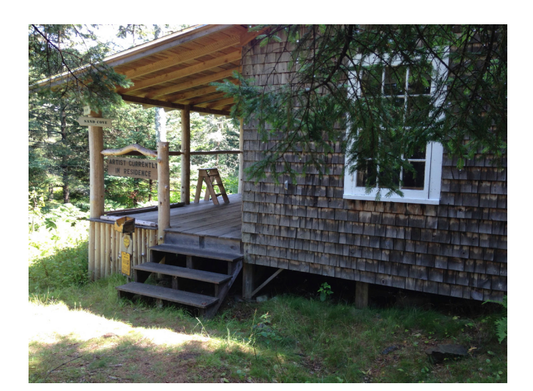
Main Lodge, exterior and interior

Application and $40 Application Fee must be paid online at: http://hogisland.audubon.org/programs/art The required supporting materials must be submitted via e-mail: hogislandarts@audubon.org