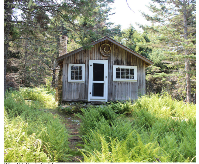
The Writer's Cabin

Applicants should be in good health and should be able to regularly walk the 6/10-mile uneven wooded path to the main campus for services. The path is very dark after nightfall. Expect solitude and immersion in nature, including varied weather and the possibility of ticks and mosquitoes.