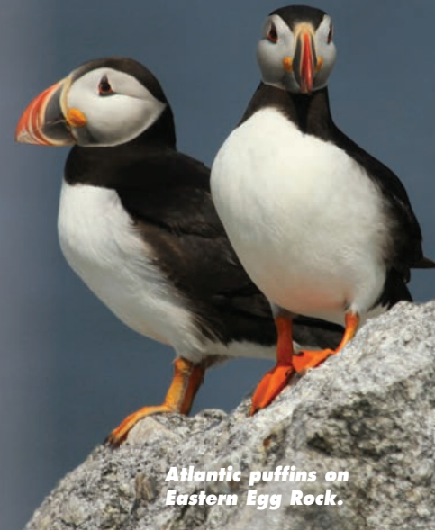
Atlantic puffins on Eastern Egg Rock.